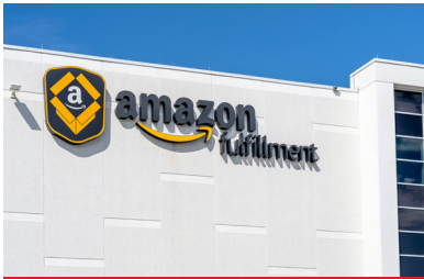
Amazon Fulfillment Center