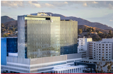
Loma Linda University Medical Center

DGA has the experience to review a wide variety of plan types. Some of the complex projects reviewed by DGA personnel include: