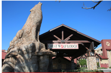
Great Wolf Lodge